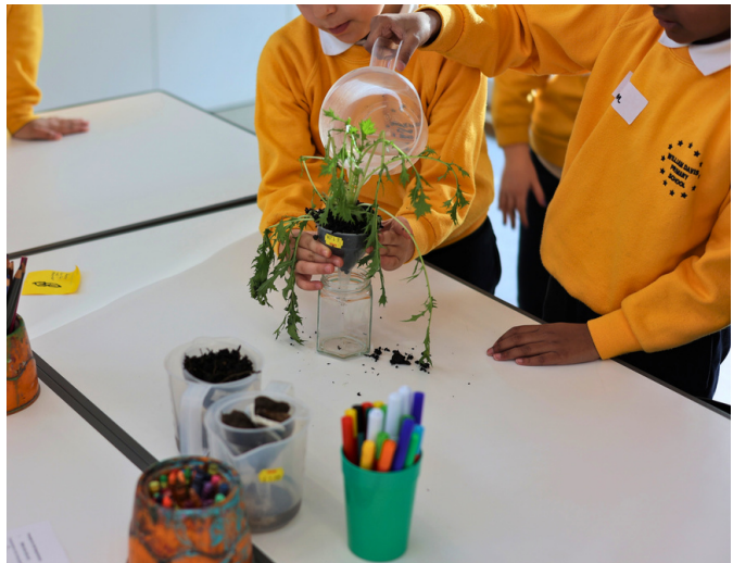
Children from William Davis Primary School testing soil water retention.

In January 2024, our Branson Coates gallery closes for the groundbreaking "Real Rooms" project, a complete reimagining of our famous roomsets - from the 1870s to the future - exploring a more diverse range of dwellings and the everyday stories of the people who may have called such spaces home. We do hope you will join us at the Winter Gathering on the 8 December to say goodbye to the gallery as it is currently and for our grand reopening party in June 2024.