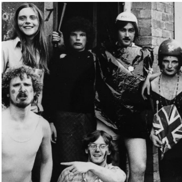
Image: On Railton Road picturing the 'Mr Punch' Original Cast 1975

A powerful and moving story of queer communities in Brixton, On Railton Road is the first theatre production to be staged at Museum of the Home. Be one of the first to see the play at the Museum and have the opportunity to meet Director Ian Giles and Writer Louis Rembges.