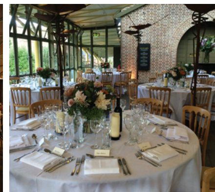
Photo Credits: Top - FourGables, James Wicks Photo; Bottom L - Adelle & Harry wedding, Nicola Hippisley Photography; Bottom R - Museum of the Home.