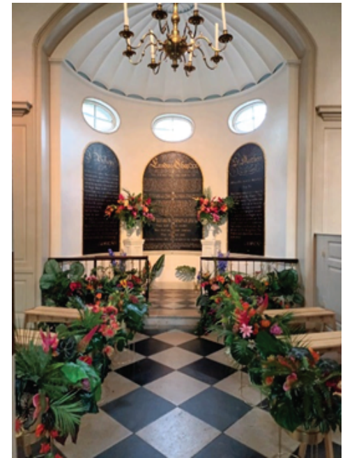
Photo credits: Top L - Sarah & Dan Wedding, Kevin Fern Photography Top R & Bottom L - Museum of the Home.